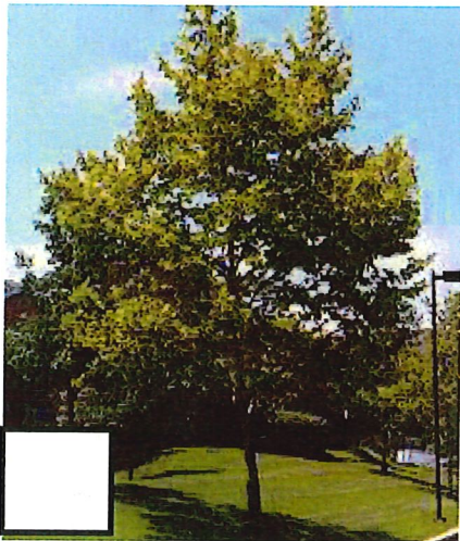
London Plane Tree